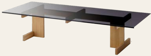
A - C T 0 1