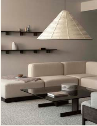
N - S 0 2