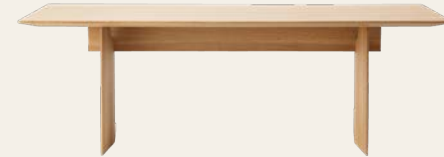
N - DT01

composition, but with a warm and welcoming feel to it.