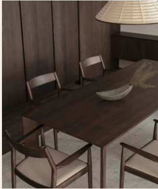
A - DT 0 2