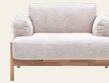
A - S 0 1

Matching the height of the sofa A - S01 while referencing the traditional Japanese, short legged chabudai dining table, the coffee table A - CT01 by Keiji Ashizawa can be utilized while seated on the floor. The transparent glass top highlights the structure of the legs in an honest way, celebrating the material.