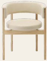
N - SC 0 1