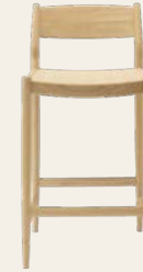
N - BS 0 1

neither a stool - but combines the best of the two and therefore serves the real needs of the cafe.