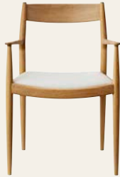
N - DC01