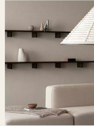
N - W S 0 1

Japanese culture. This notable feature connects the furniture piece to many of the other Karimoku Case Study products, creating coherence across the collection.