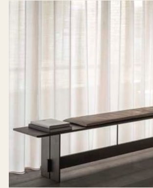
A - B 0 1

tabletop supported without aprons. The legs and edge of the tabletop follow the flow of the dining chairs N - DC01 designed by Norm Architects, creating a soft and light feeling. When placed in the space, the wooden table seems to float. Despite its size, its presence does not overwhelm the space. Rather, it allows the organic form of the chairs placed around it to stand out.