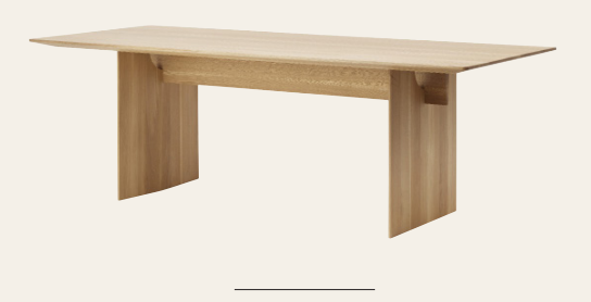
N - DT01 DESIGN: NORM ARCHITECTS

For case study 08, the Hiroo Residence Project, the N-ST01 side table has been modified with an extended marble table top.