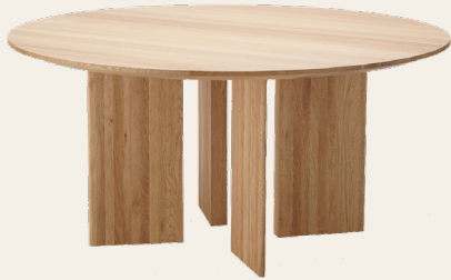
A - DT 0 3