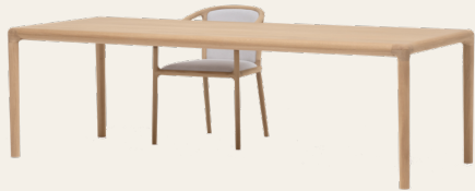
NF-DT01 DESIGN: NORMAN FOSTER

The dining table has a simple silhouette and refined geometry that are characteristic of the NF Collection. The soft corners embrace the language of the NF-DC01, whose sloping armrests tuck neatly into the matching angle on the table's underside.