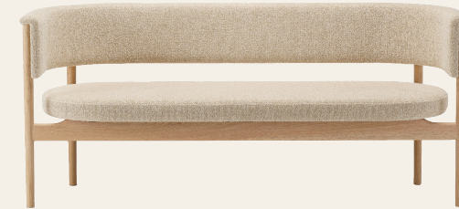
N - CC 0 2

At Salone del Mobile the table will be showcased with the width of 90 cm.