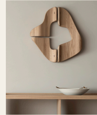
AP - PLATEAU 02 DESIGN: ATELIER PLATEAU

are layered so that they appear to be weaved together, creating a refined and calm expression.