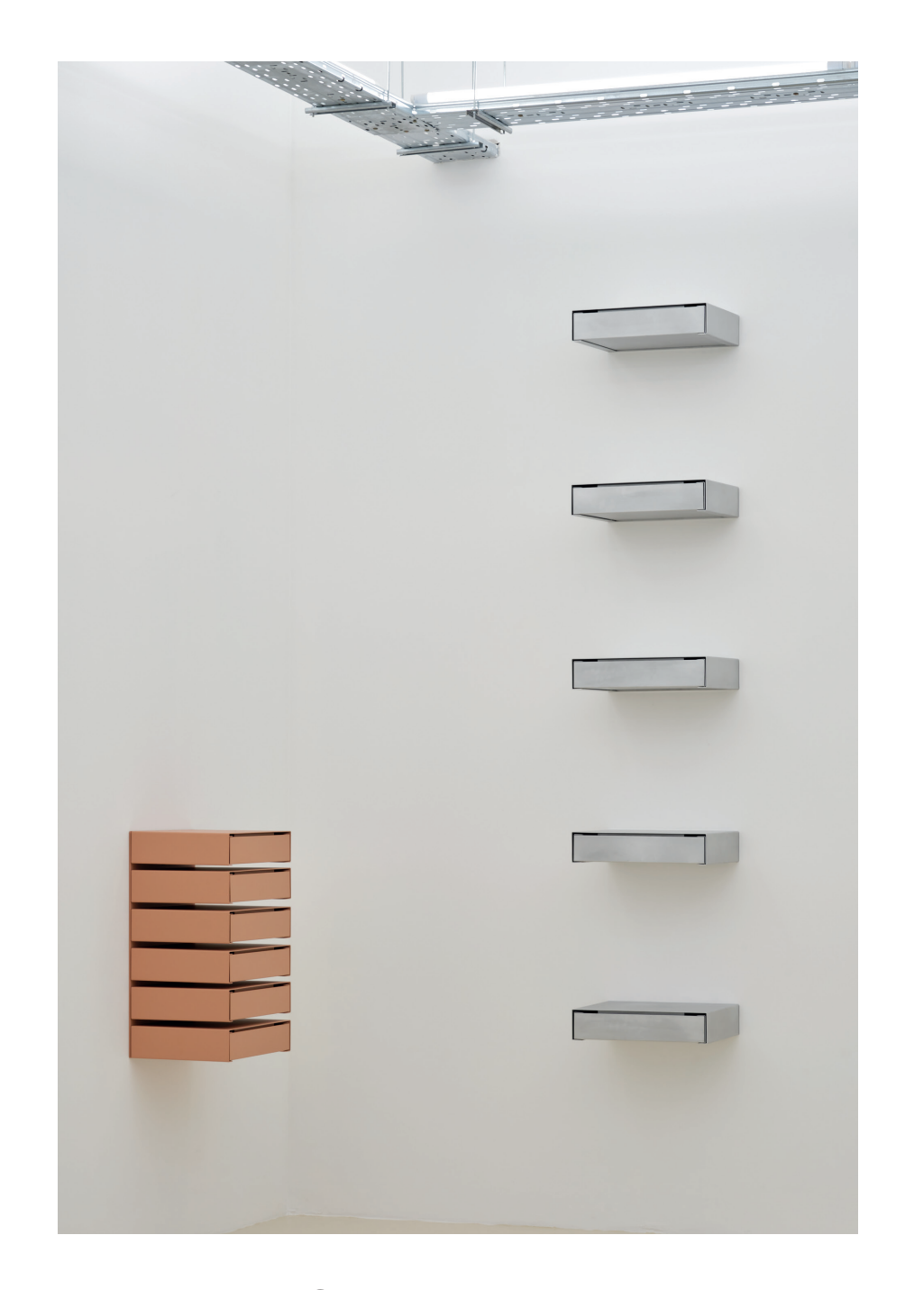
KGT WALL UNIT Design by Studio CP-RV