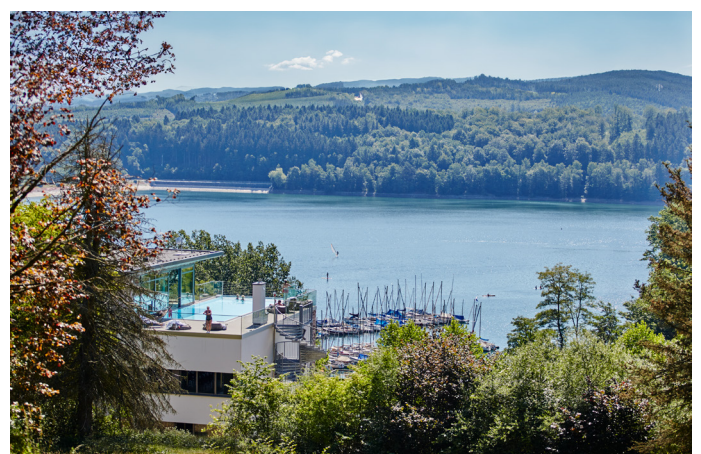
studio aisslinger_Hotel Seegarten__Thiemann_1.jpg

Available image material. For high-resolution image and plan material, please contact: studioaisslinger@brand-kiosk.com