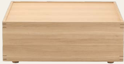
N-S02 | TABLE DESIGN: NORM ARCHITECTS

The N-S02 | Table stands firmly on its own even though it stems from the N-S02 series. Serving as a natural transition from the soft cushions, the table module allows for various applications, inviting its user to piece together a sofa that suits one's needs. Exquisitely crafted joinery details compliment the design and underline a production heritage so unique to Karimoku, creating coherence across the collection.