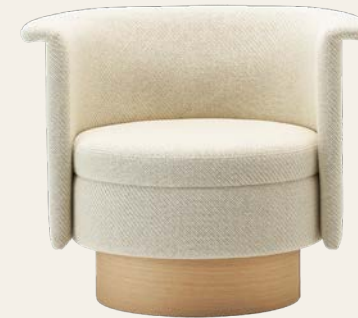
N-SW01 | SWIVEL CHAIR DESIGN: NORM ARCHITECTS

The N-S02 | Table will be available in Pure Oak, Smoked Oak as well as Grain Matte Black and the new Keyaki Brown.