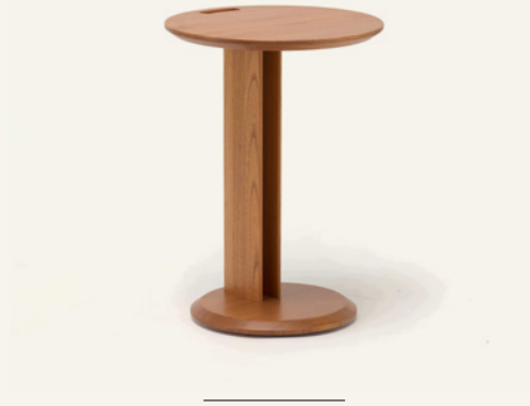
N-ST03 | SIDE TABLE BY NORM ARCHITECTS

The N-ST03 | Side Table functions as an entirely new extension of the Karimoku Case collection. Crafted in solid wood, the table boasts an asymmetrical frame that has been meticulously engineered to gracefully overlap and complement sofas and coffee tables alike.