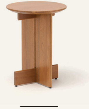
A-ST01 | SIDE TABLE BY KEIJI ASHIZAWA

The recessed handle is elegantly integrated into the tabletop, making it easy to move while ensuring its usability across diverse settings – from hospitality and workspaces to private residences.