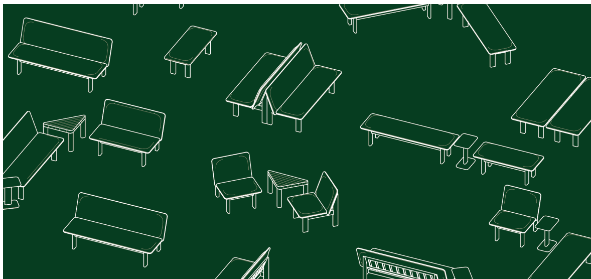
WK Sofa Series (Prototype)