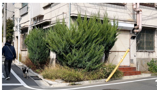
Taisuke Koyama “City Plants”

One of the symbolic highlights of this lounge is the video installation “City Plants” by Shinji Otani and Taisuke Koyama (Tokyo Photographic Research). Featuring imagery such as plants growing through cracks in asphalt, potted plants discreetly placed by citizens, and forgotten green corners of the city, “City Plants” uses two video works to portray nature quietly living within inorganic urban environments and gradually reclaiming and transforming them. The plants, finding the slightest of gaps, grow flexibly and powerfully—becoming a tribute to the resilience and beauty of nature that never fades, even in adversity. Sitting on the lounge sofas, visitors can quietly immerse themselves in this visual world and reflect on how we relate to nature. It becomes a serene moment, reconnecting us with the natural world we may have begun to forget amidst the noise of everyday life.