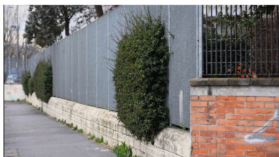
Shinji Otani “City Plants”